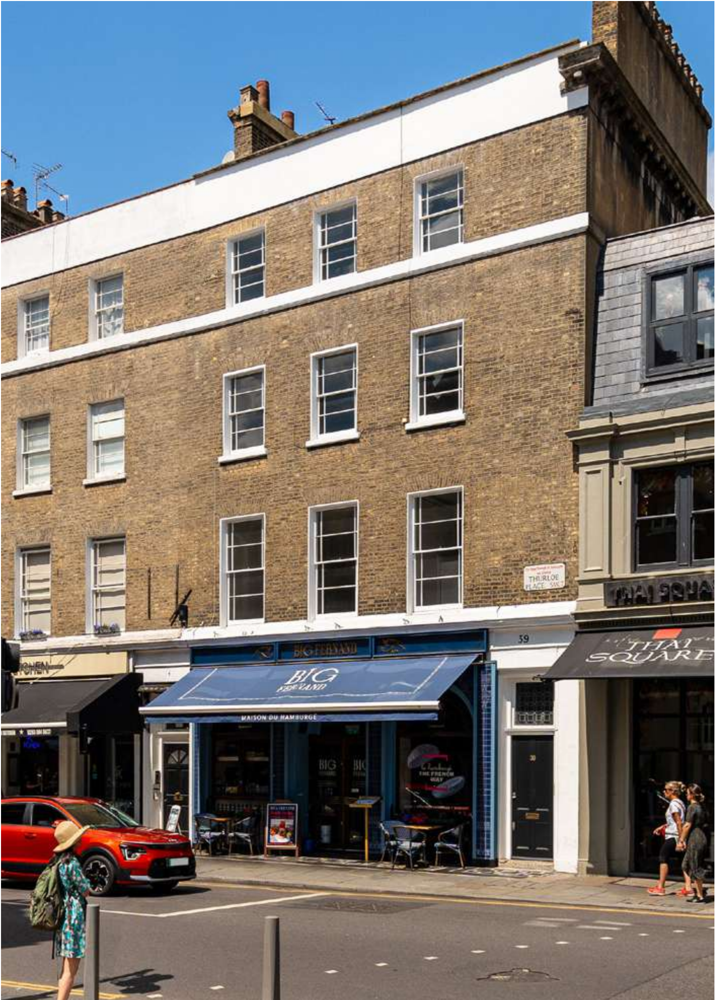
No.39 Thurloe Place